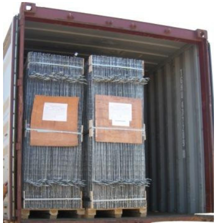
Panels in container

Creators of the Patent Pending V-Squared Panel.