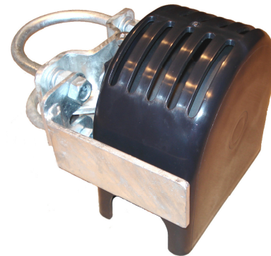
Round frame / post roller shown with cover and guard installed.