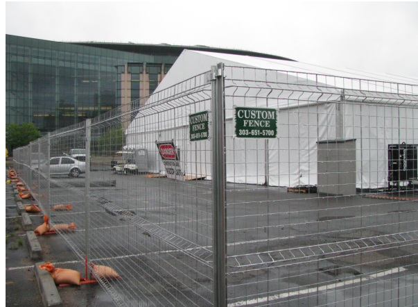
Media tents set up outside the Pepsi Center in Denver were secured by V-Squared Temporary fence provided by Custom Fence Supply.