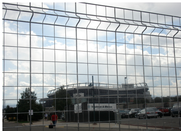
The project was expanded to include nearby Invesco Field at Mile High for the closing night of the convention.

Larsen went on to report that many of Hospitality suites were stripped of furnishings and transformed into media broadcast booths. The ceiling of the center had to be reinforced to support the 300,000 pounds of lights and speakers that were added. A media tent city outside the venue was constructed including 3,000 data lines and 2,500 voice circuits requiring roughly 160 miles of copper and coaxial cable and dozens of miles of fiber optic cable. The transformation for the event was lead by Alvarado Construction of Denver together with Turner Construction and HOK Sport Venue Event, the center’s original architect.